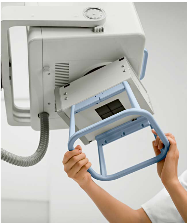
Freely rotatable head